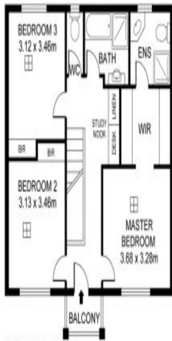
FIRST FLOOR - 68 SQM