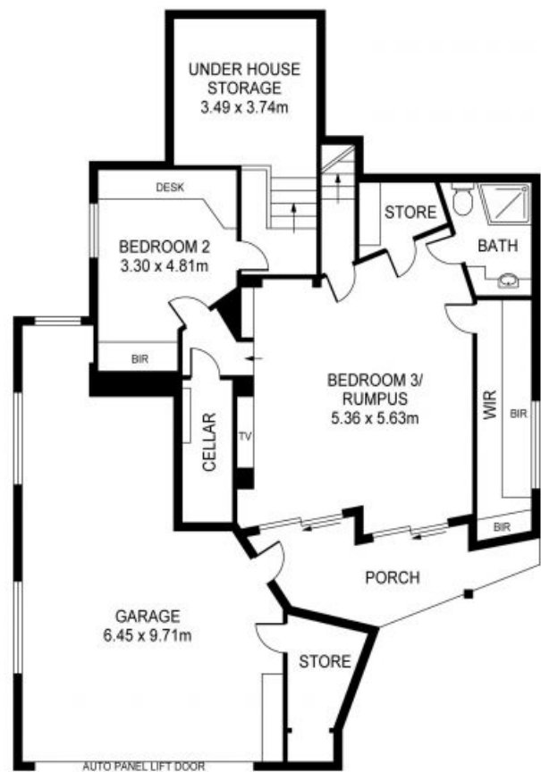
LOWER LEVEL - 144 SQM

12 GORDO AVENUE, WATTLE PARK APPROX. GROSS INTERNAL FLOOR AREA 281 SQ M